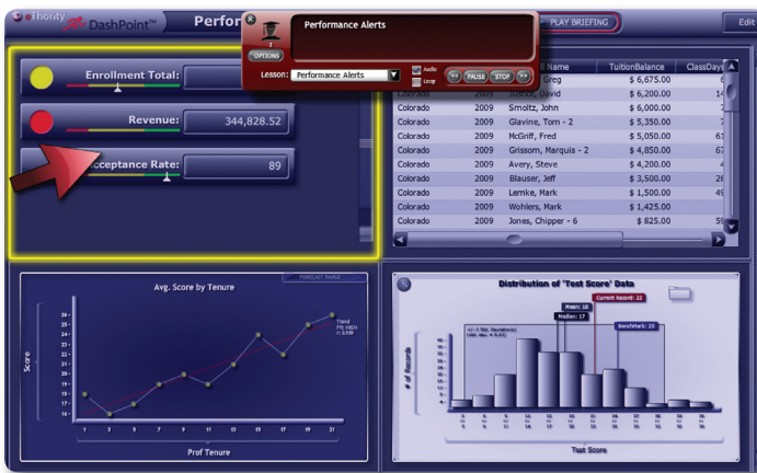
eThORITY® Dash™ "Briefing Mode" interface